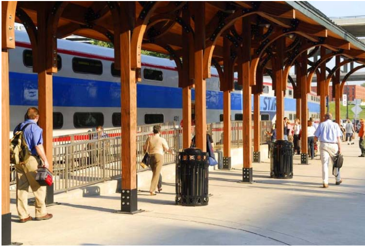
Passengers board the Music City Star at Riverfront Station.

Several Music City Star riders have formed a local train riders advocacy association to help raise public awareness and support for Tennessee's only commuter rail service.